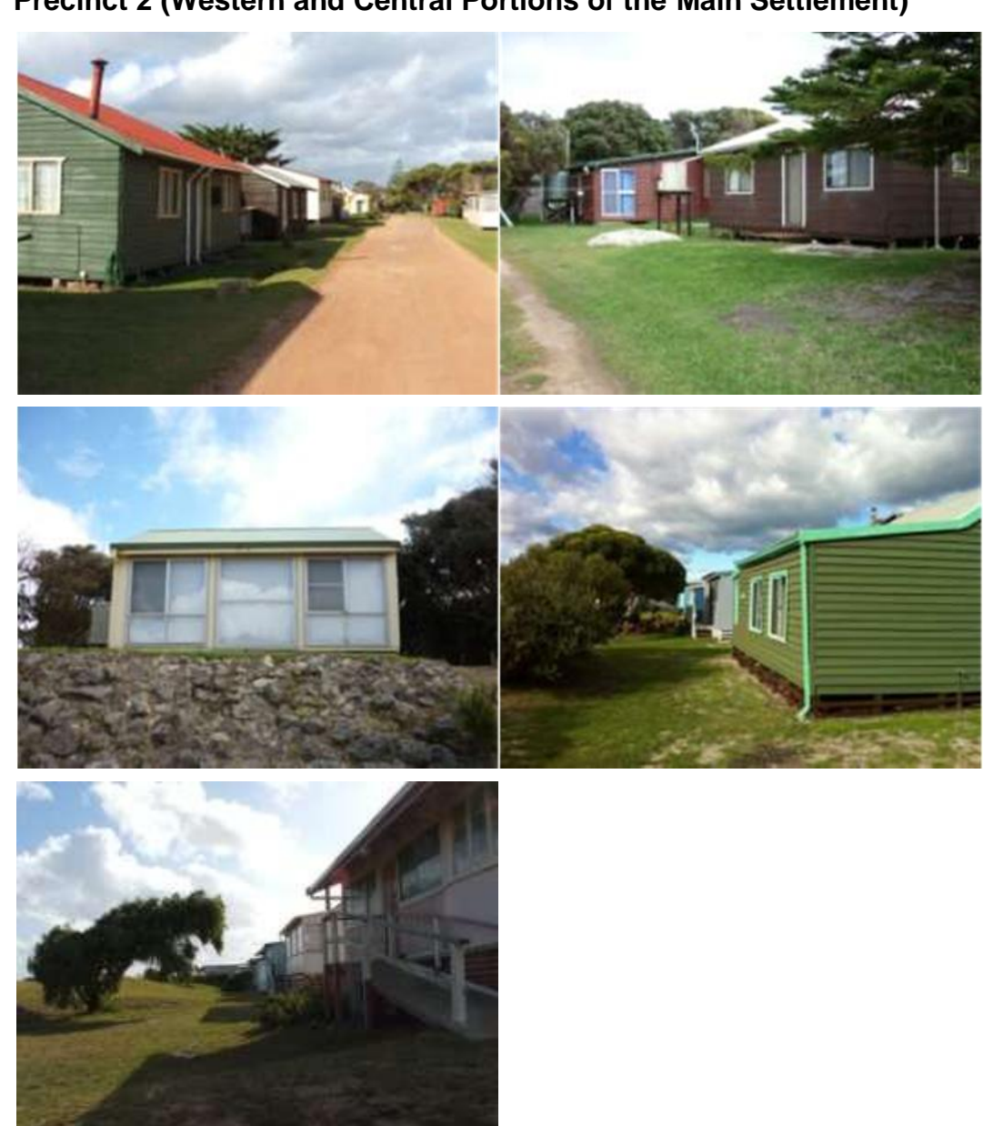
Precinct 2 (Western and Central Portions of the Main Settlement)

Appendix to Local Planning Policy 6.1.16