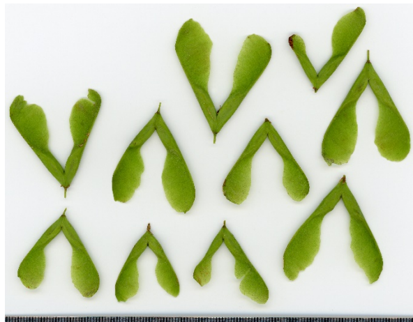
Acer negundo flowers