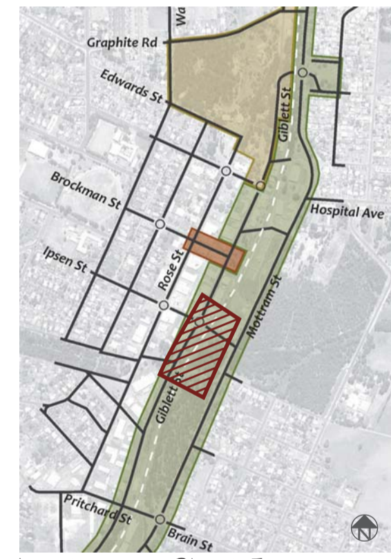
Location map Sheet 5

No lighting shown on this plan as subject to electrical engineer design and approval. Western Power decorative range to be used for lighting of South Western Highway/Mottram St between the southern and northern Timber Arch. Indicative design only. To be confirmed during detailed design phase in conjunction with relevant experts.