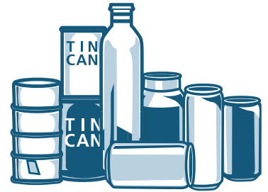
Steel & aluminium cans