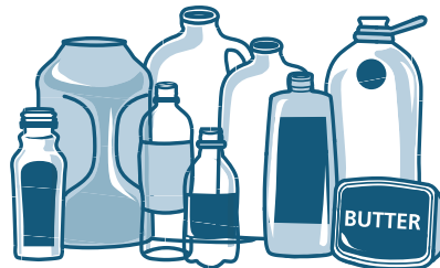
Plastic bottles & containers (remove lid)