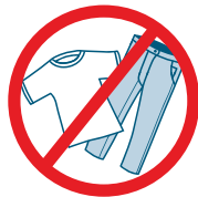
No textiles/ clothing