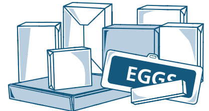
Cardboard boxes (please flatten)