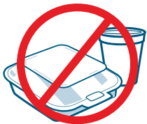
No polystyrene, meat trays, cups & beads