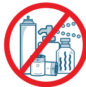
No gas bottles, flares, batteries or aerosols