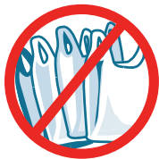
No plastic bags or soft plastics