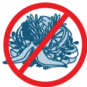
No green waste or food waste